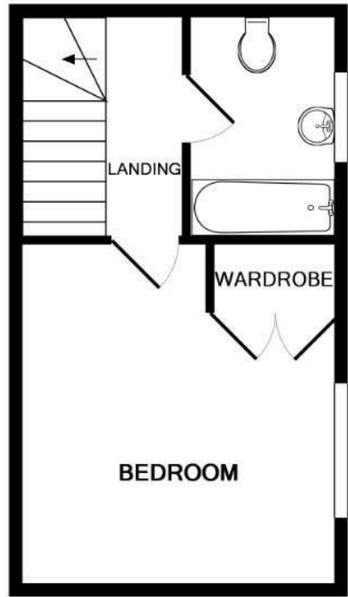
1ST FLOOR APPROX. FLOOR AREA 253 SQ.FT. (23.5 SQ.M.)

TOTAL APPROX. FLOOR AREA 514 SQ.FT. (47.7 SQ.M.)